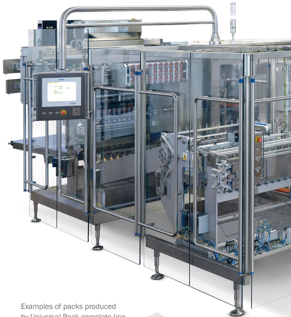
Examples of packs produced by Universal Pack complete line

Adjustments and size changeovers are performed without using tools.